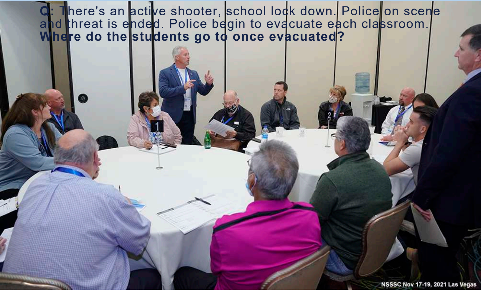
NSSSC Nov 17-19, 2021 Las Vegas

Q: There's an active shooter, school lock down. Police on scene and threat is ended. Police begin to evacuate each classroom. Where do the students go to once evacuated?